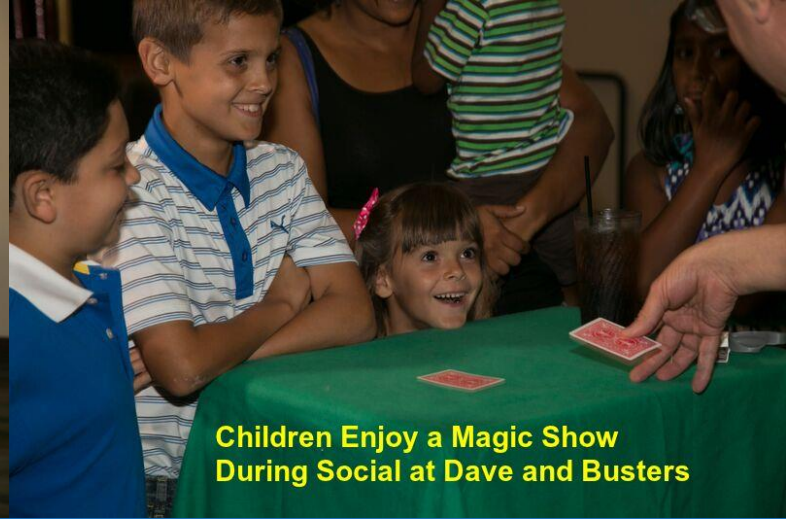
Children Enjoy a Magic Show During Social at Dave and Busters