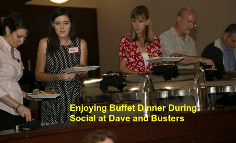
Enjoying Buffet Dinner During Social at Dave and Busters