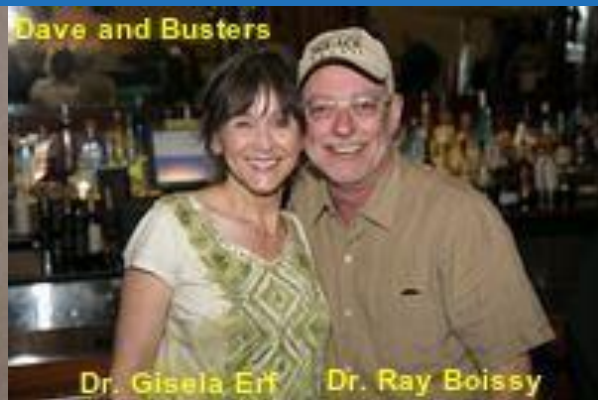
Dave and Busters