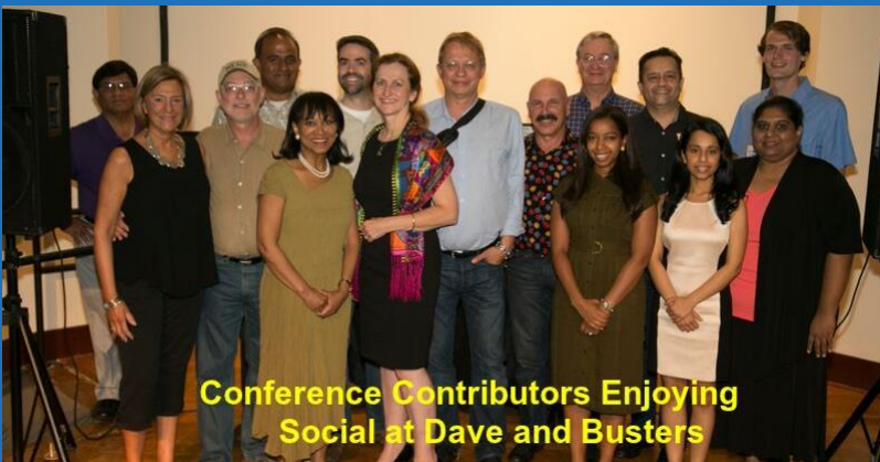
Conference Contributors Enjoying Social at Dave and Busters